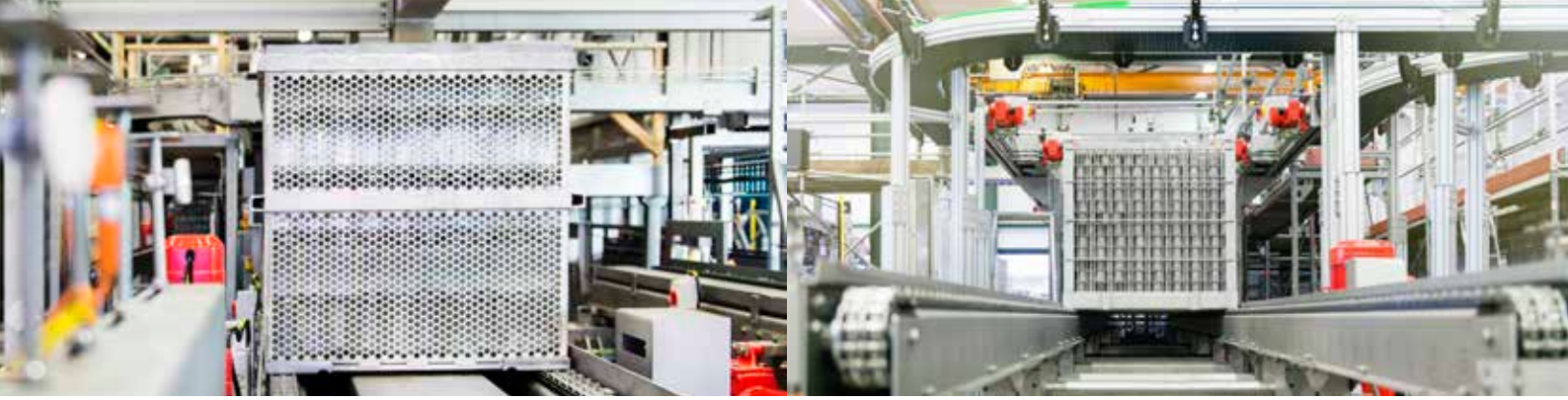
Shuttle with jars